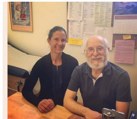
Our Free Medical Clinic provides basic medical services, offers patient navigation support, and hosts specialized medical services.