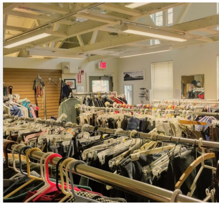
Amherst Survival Center's Community Store : donated clothing and household items made available to everyone for free.

Take the PVTA Bus #33 Right To Our Door!