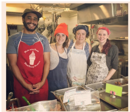
Our staff and volunteers help prepare and serve a hot nutritious lunch every weekday except Wednesday