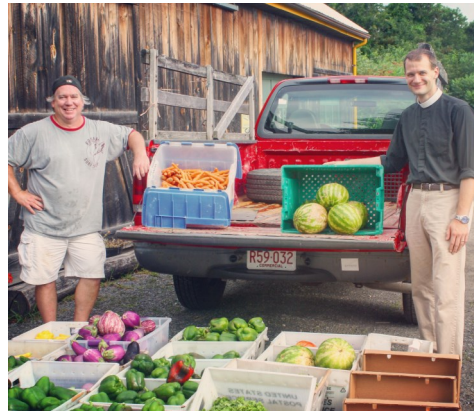
Free produce & baked goods are rescued by volunteers, donated by farms & businesses. The Center distributes produce M/T/TH/F.